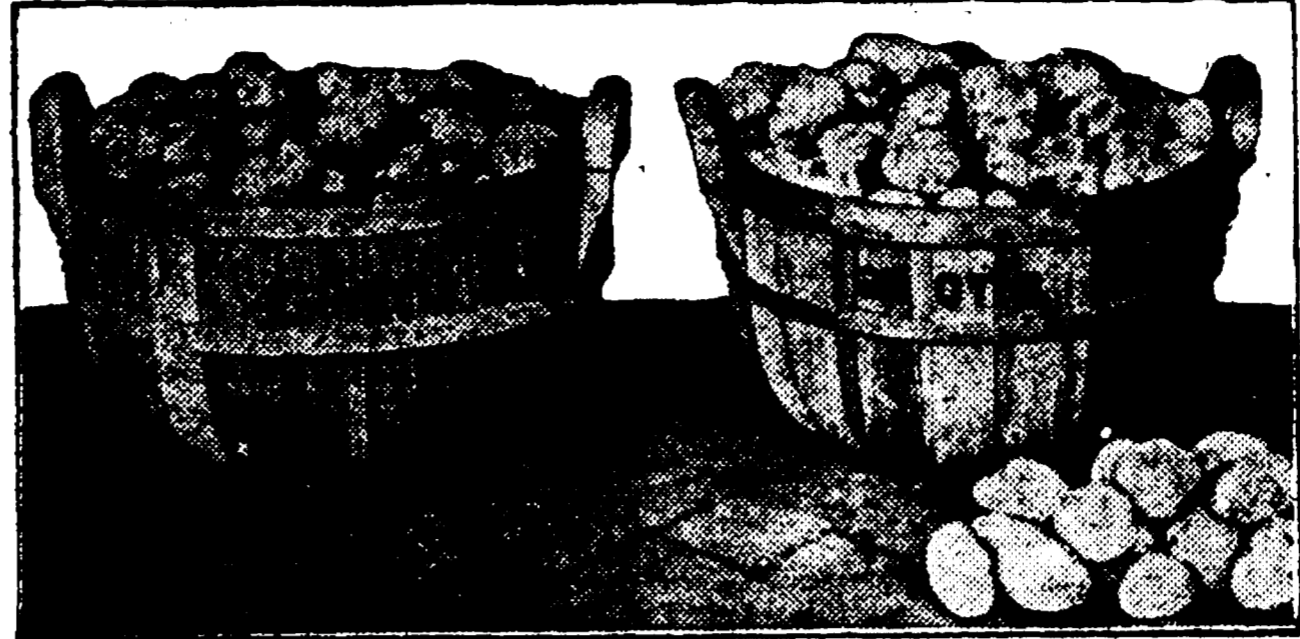
The basket on the right may appear to hold more potatoes, but in fact it contains fewer potatoes than the one on the left.

It is generally agreed that if food costs are to be lowered a more economical system of distribution of farm products must be perfected and placed in practical use.