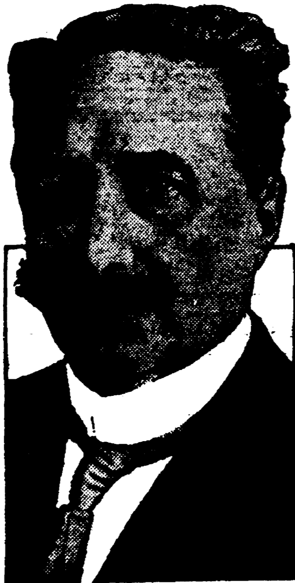
M. PAUL DESCHANEL

Paris.—Paul Deschanel, president of France, has presented Premier Millerand with a letter of resignation, and his presidential message which accompanied it has been read to the Senate and the Chamber of Deputies.