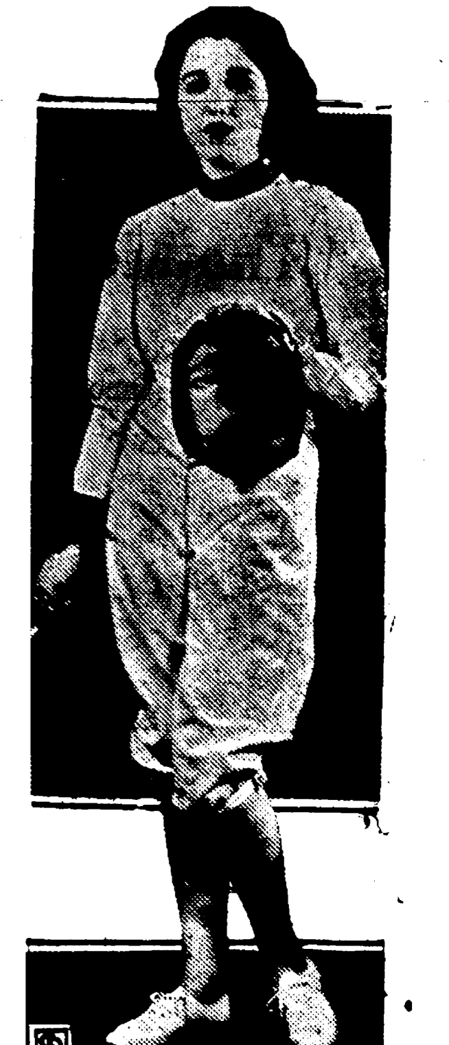
En garde! Or words to that effect, for here is Bebe Daniels, all set for a bit of fencing with somebody.