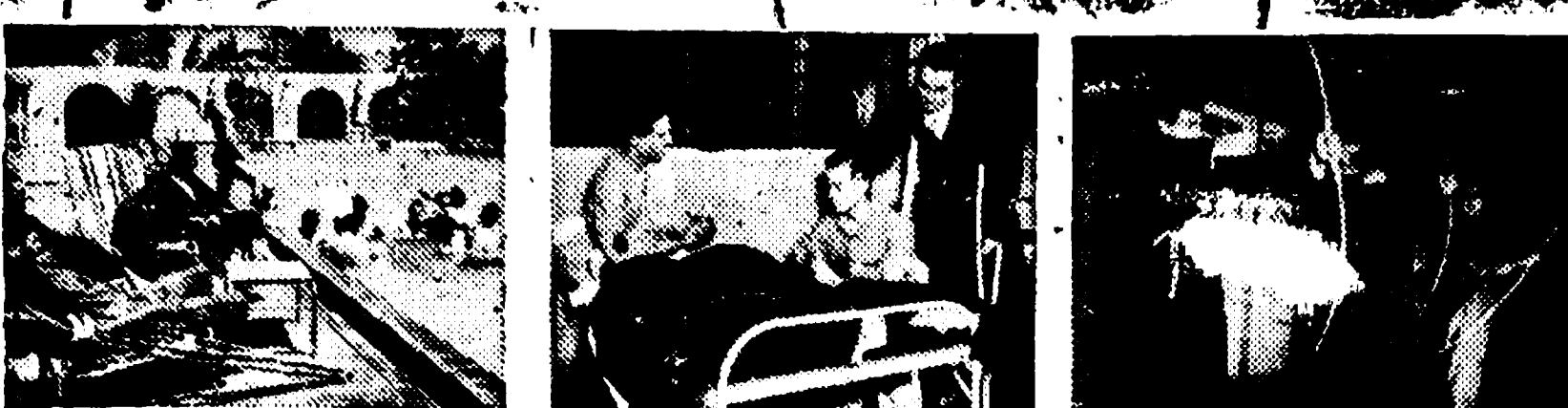
RECOVERING O. I.'s in the pool next to the PX at Torney General Hospital, Palm Springs, Cal. GIN RUMMY and other popular card games help while away the long hours of convalescence at the hospital in Camp Shanks, N. Y. ARCHERY passes the time and helps wounded boys recover at the Station Hospital in Fort Bliss, Tex.

ADOPT A HOSPITAL! Wounded boys are coming "home" to these 655 servicemen's hospitals. More than 1,200 a day are arriving by plane and ship from the battle-fronts. Many of these men are bedridden. They're hospitalized for weeks . . . months . . . and the time passes so slowly. You can help these boys who have given so much — for you! Adopt a hospital! Many organizations collecting waste paper are channeling some of their waste paper funds to buy little extras for disabled servicemen . . . long distance phone calls home, games, musical instruments . . . the morale-builders that mean so much. Adopt a hospital! There are hundreds of these items. Ask the hospital Chaplain or your local Red Cross Camp and Hospital Committee. They'll be glad to suggest what's needed. There's a serviceman's hospital near you — probably with local boys in it. Or your organization may choose to help a more distant hospital. Don't put it off. The boys are there now. They don't ask for much . . . but they deserve a lot! Obey that impulse!