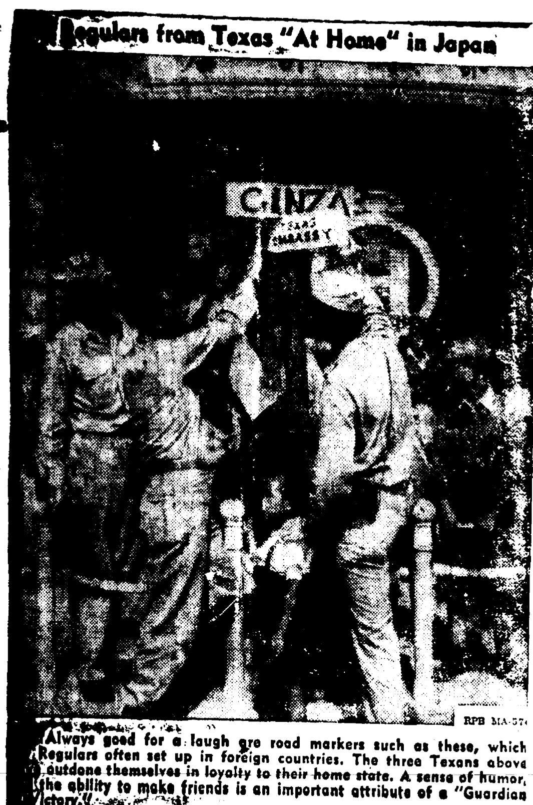
Always good for a laugh are road markers such as these, which Regulars often set up in foreign countries. The three Texans above have done themselves in loyalty to their home state. A sense of humor, the ability to make friends is an important attribute of a "Guardian".