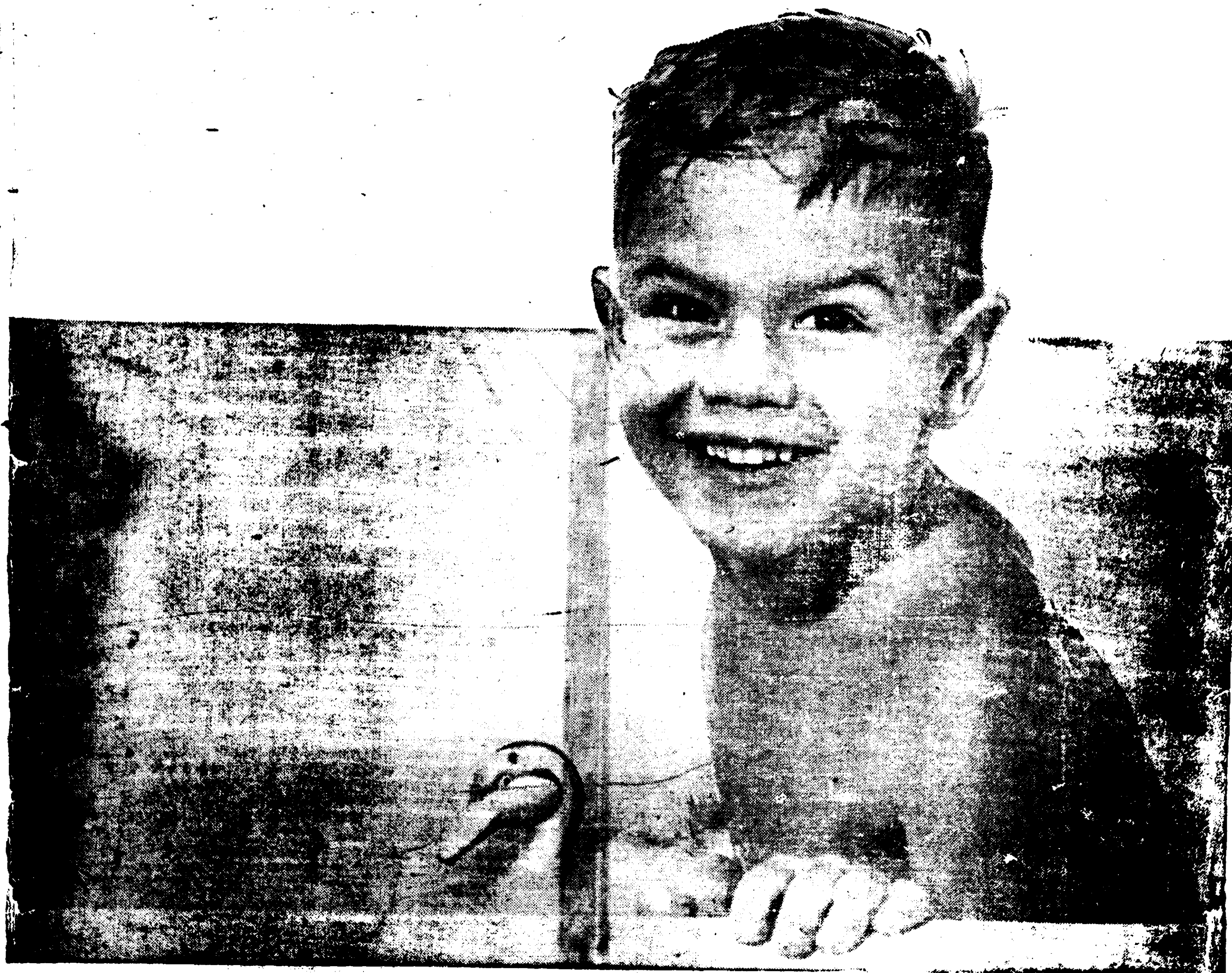
Bath time is fun time with lots of hot water

1937 electric water heaters, built to Edison's rigid specifications, give you all the hot water you want!