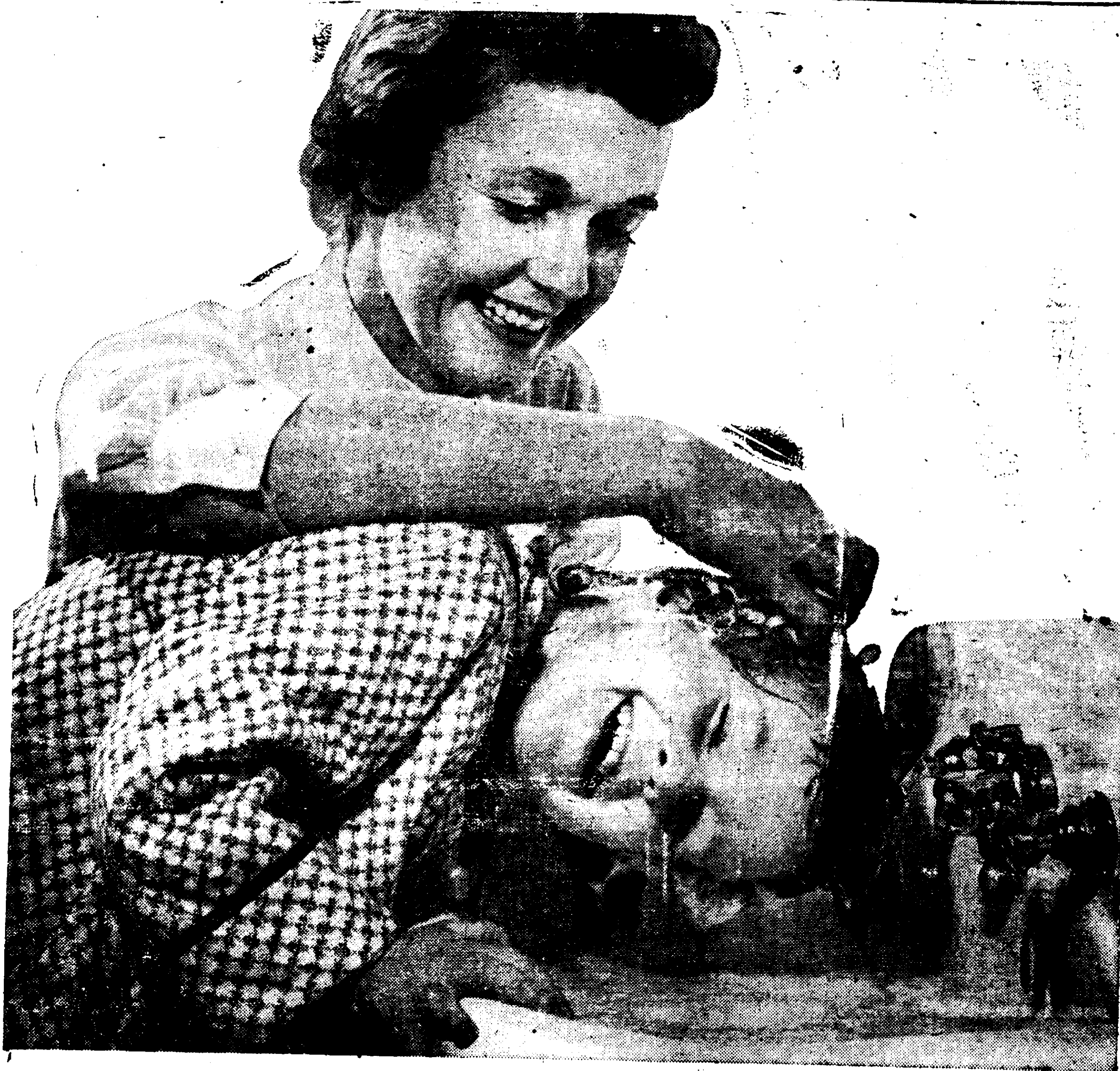
One way to keep the family in hot water—and enjoy every minute of it.