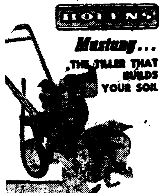
Mustang... THE TILLER THAT BUILDS YOUR SOIL

Time action that builds soil Nature's way... suggested power, that makes your gardening easy... good reason why the Bollen's Mustang is today's best buy by far in rotary tillers. AS LOW AS $1,200 Easy time payments ASK FOR A DEMONSTRATION