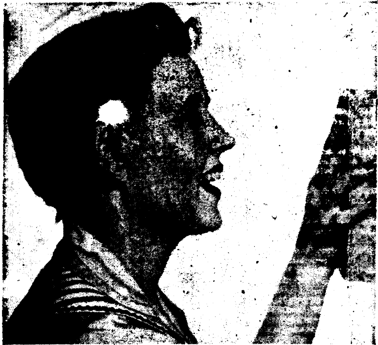
Hot water helps housewives hurry through housework.