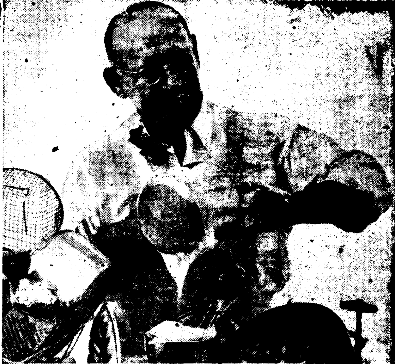
Dishwashing's a cinch with plenty of hot water.