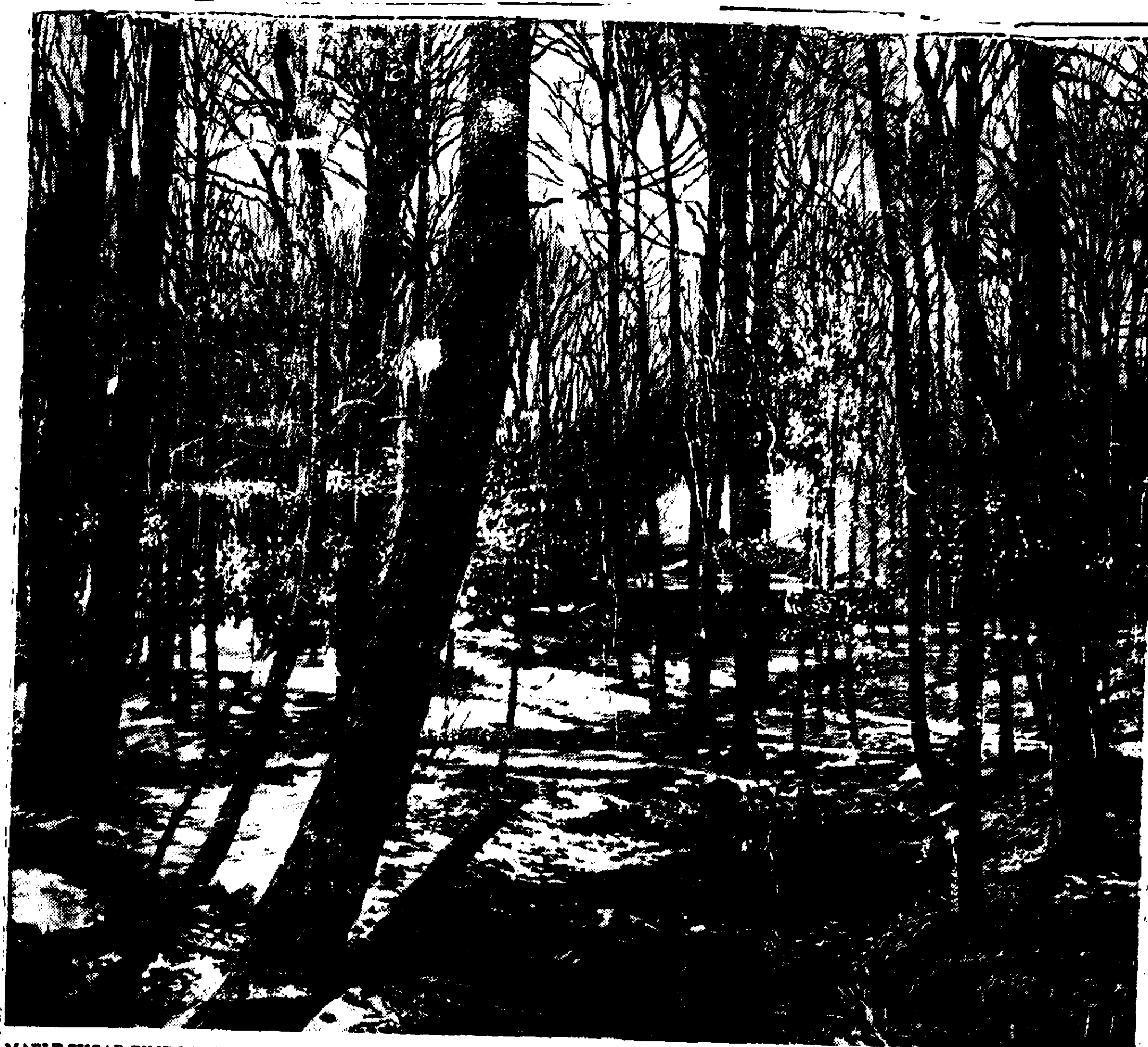
MAPLE SUGAR TIME NEAR VERMONTVILLE

Free Full Color Reproduction suitable for framing sent upon request