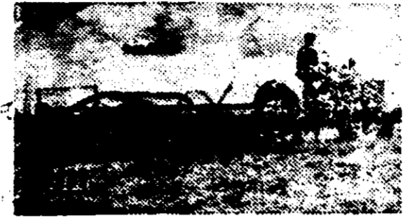
Hay yields are higher with good soil care.

TOP-DRESSING alfalfa fields with fertilizer every year can pay off in extra tons of hay per acre per year, says the Middle West Soil Improvement Committee, in citing tests by Wisconsin soils specialists.