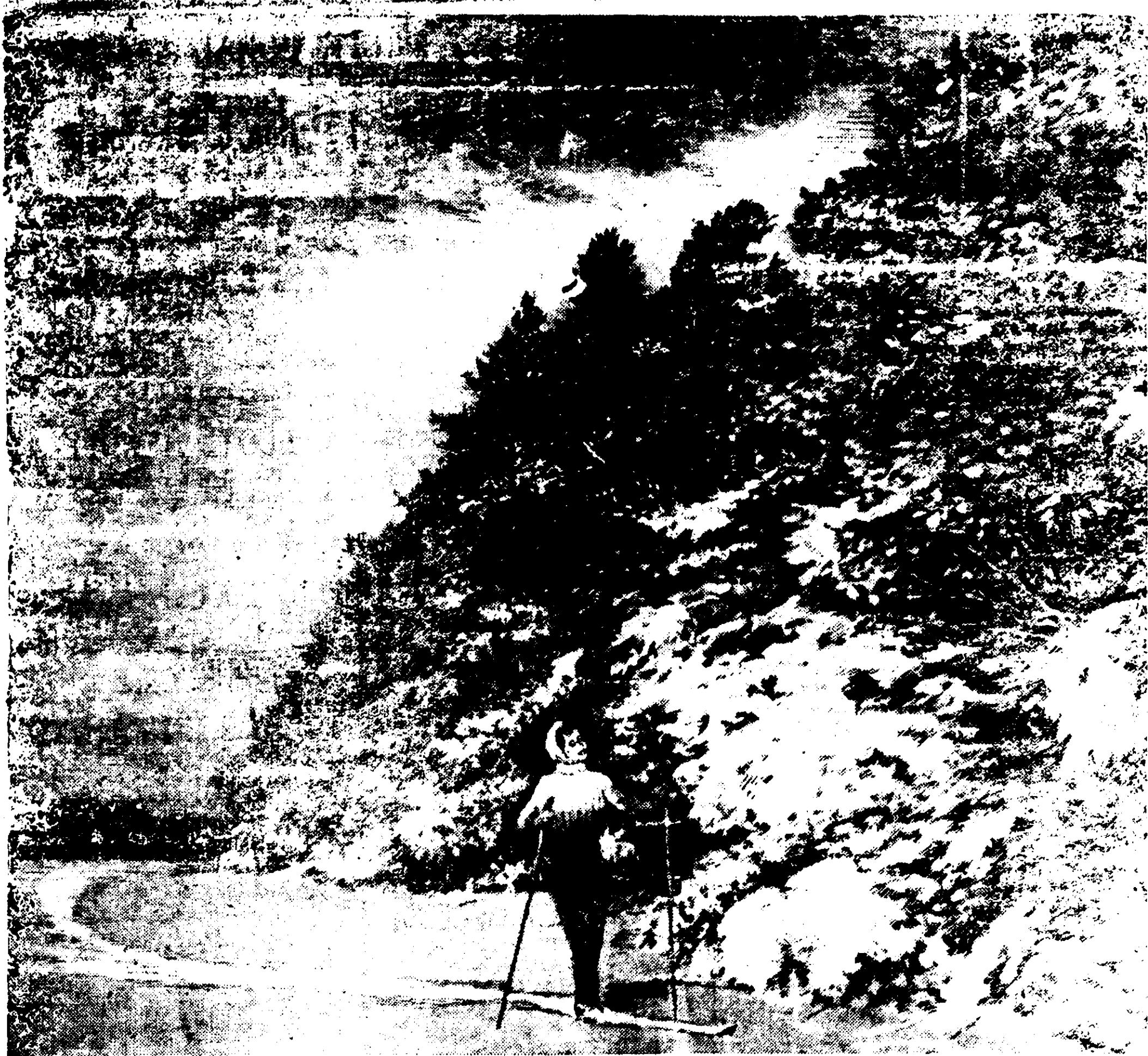
PINES NEAR GAYLORD