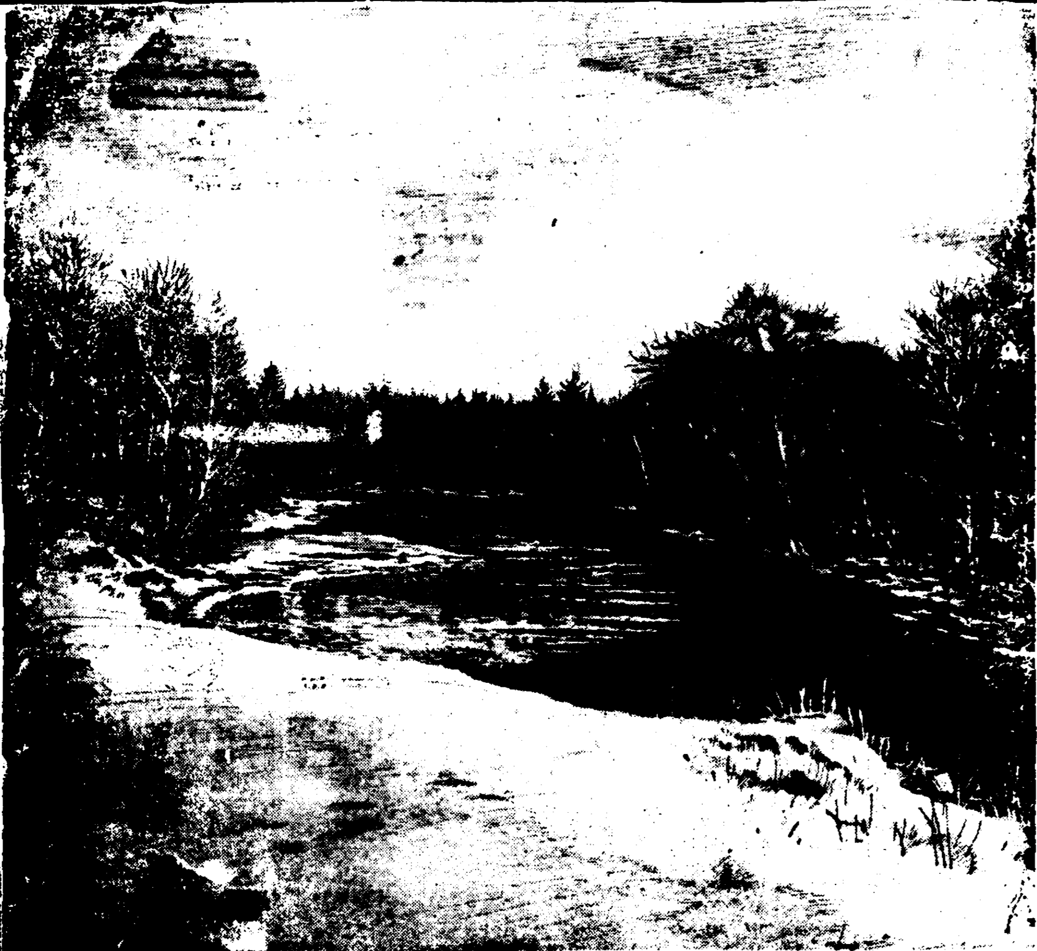
SCENE ON AU GRES RIVER