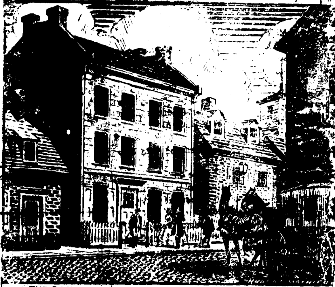
THE BANK OF NORTH AMERICA - PHILADELPHIA, PA. - 1781

ACT OF CONGRESS ESTABLISHING THE BANK OF NORTH AMERICA - 1781