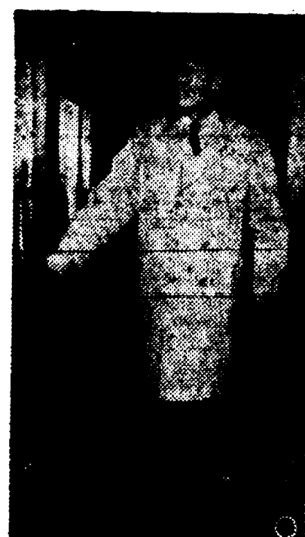
COAT-WISE—The double-breasted look makes news in this distinctive water-repellent coat of choice cotton. By Alligator, it has raglan sleeves, half cuffs, and handy breast pocket.