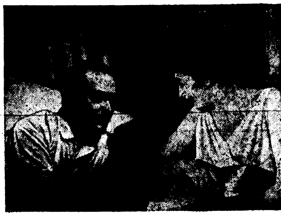
BOB HOPE AND Lucille Ball two of the funniest people in the world, will be the screen at the Lakes Drive-In Theatre starting Sun. April 28. in "CRITICS CHOICE."